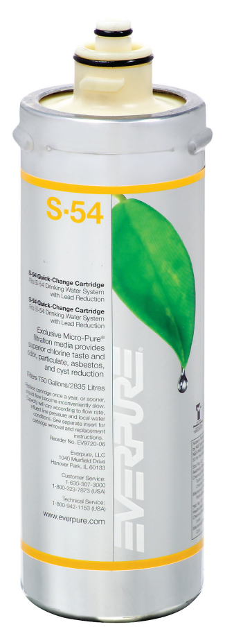
Part No. EV9720-06

The Everpure S-54 Drinking Water System is the practical, low-cost solution for filtering out lead, disinfectant chlorine, dirt, rust, asbestos fibers, microscopic protozoan cysts, and other particles from drinking water, including oxidized iron, manganese and sulfides.